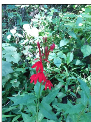
Cardinal flower found along the river at Sharon Mills Preserve

RRWC has begin a Nature Walk series this year to get more people out to enjoy our local parks and the plants and animals living in them. Nature Walks are short "hikes" in parks around the River Raisin Watershed for people of all ages and backgrounds to explore the outdoors. We identify the plants and animals we see along the trail, we talk about the history of the area we're in, and if we're near the river, we'll look at some of the life living in the water!