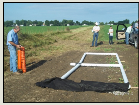
One of our farmer leaders explains how this blind inlet works to reduce sediment and nutrient loss into tile drains.

soil and water health (soil testing, putting in buffer strips, etc.) and gives them a way to pay for part of it. MAEAP was established in 1997 and continues to be a voluntary program. This year Michigan reached 5,000 MAEAP verified farms, a huge cause for celebration for the improved health of our soils and water all from farmers who care about keeping our natural resources healthy!